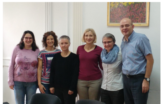
The DEMAL Project Team

We hope you have enjoyed this newsletter! DEMAL is finishing as a project. All products are currently being prepared for publication on the DEMAL homepage, and final versions of all products will be available there by end of November 2018. Building on the DEMAL outcomes, various plans for new projects are also currently being developed. Keep on visiting us for news on the DEMAL homepage. It will be functioning also after the project's lifetime.